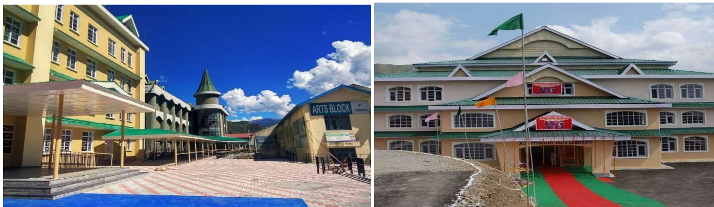
Figure: Front of Administrative Block, Science, Arts Building and Auditorium Building of Govt College Seema Rohru

Govt. College, Seema perched in the lap of a world famous Chanshal Valley Rohru in District Shimla of Himachal Pradesh and surrounded by Snow- draped Himalayas and thick pine grove forests complemented with the benign presence of Pabbar River displays a magnificent picturesque of nature's craft. It holds a majestic picturesque view and salubrious climate and congenial atmosphere ideally suited for higher studies and excellent results. Fusion of Learning with Nature's artistry endorses Govt. College, Seema as an ideal destination for academic romance. It is located at a distance of 6 kilometers from Rohru, the prominent town of the area. Infrastructure overview of the College is as bellow:-