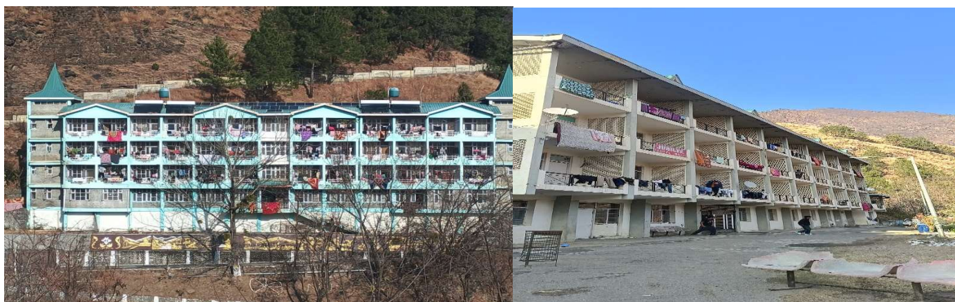
Figure: Girls and Boys Hostel of the Govt College Seema ( Rohru) Distt Shimal ( H.P)