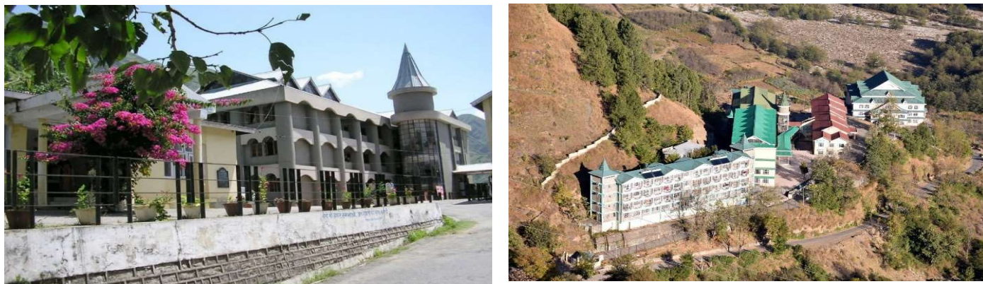
Figure: Science Building, Old College office and top building overview of the Govt College( Seema Rohru)

In the auditorium building, there is auditorium with 1000 seating capacity and on the one floor of this building library of the college is there, having seating capacity in general section 120, career counselling section 40 and e- library/ digital library section having 30 seating capacity.