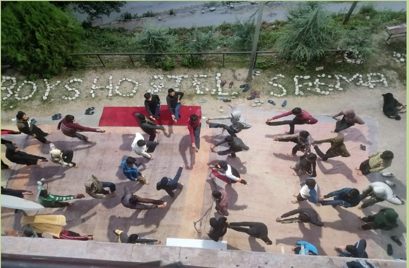
Yoga Session for Boarders