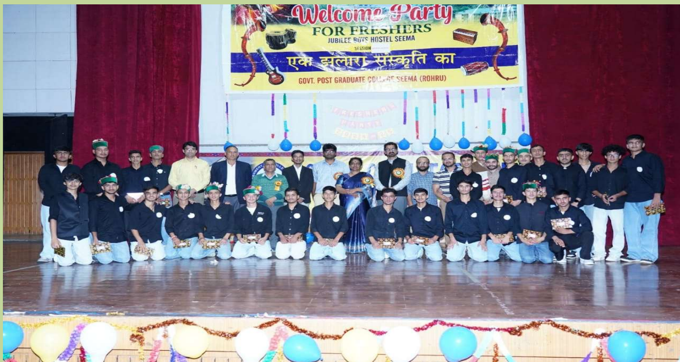
Fresher's Party Boys Hostel