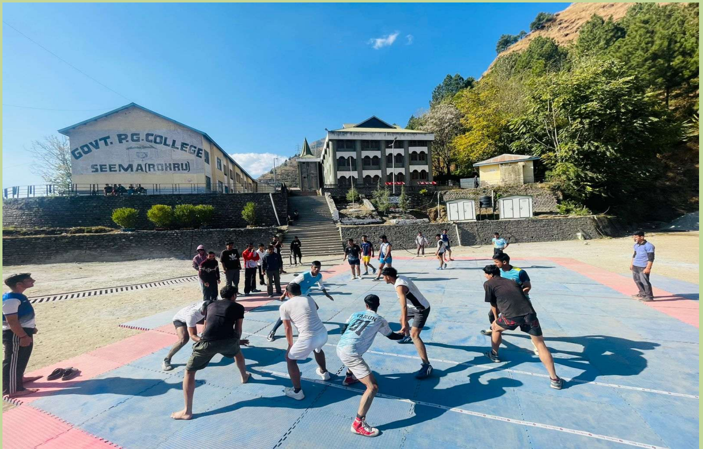
Hostel Sports Meet