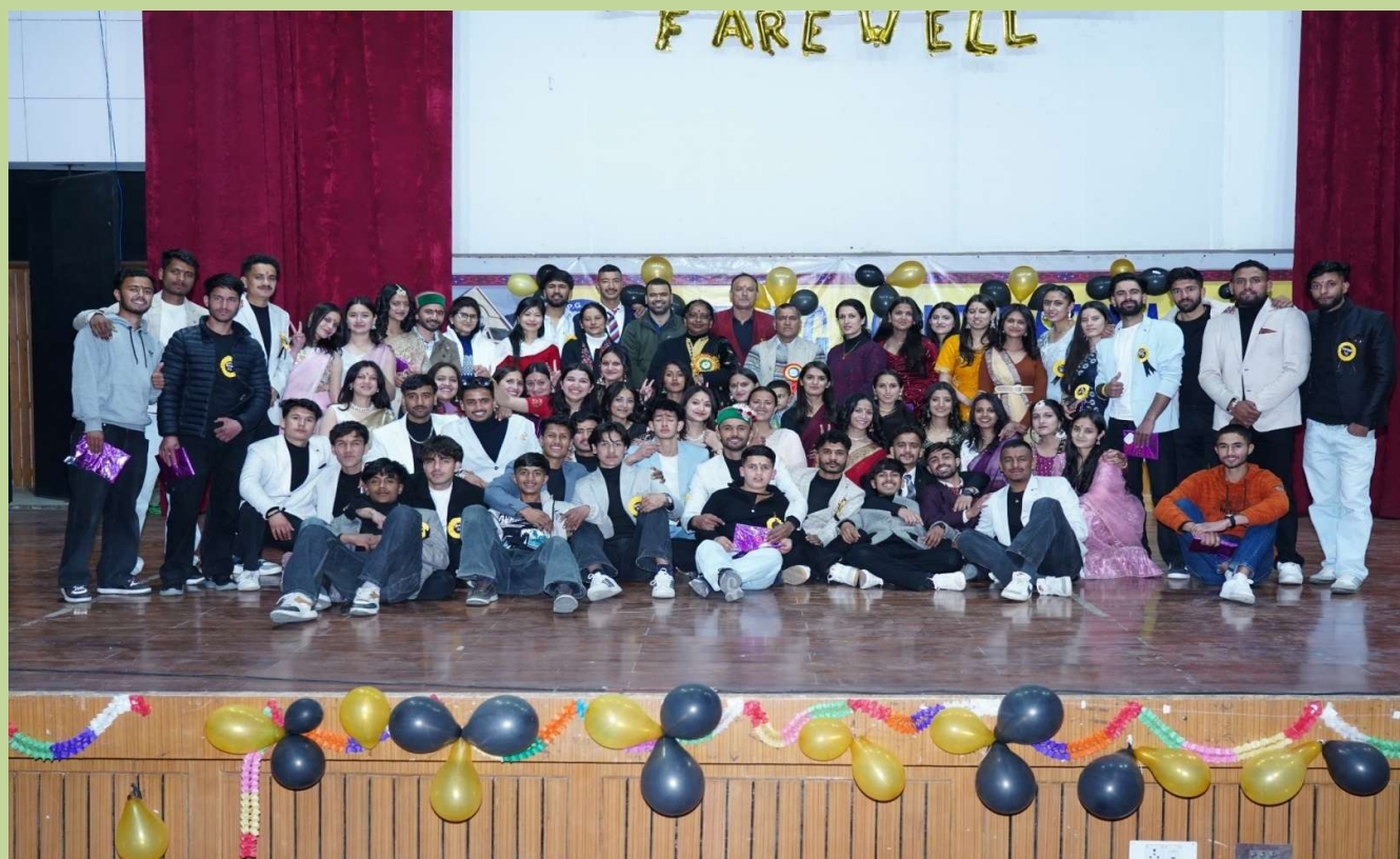
Farewell Party Boys & Girls Hostel