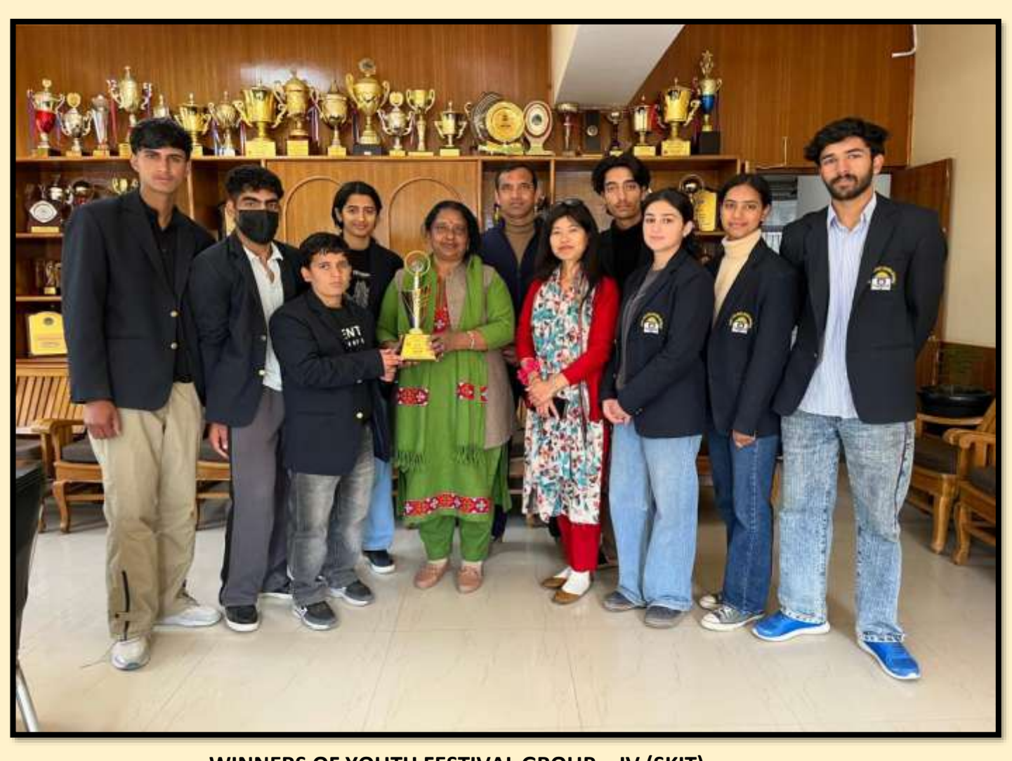
WINNERS OF YOUTH FESTIVAL GROUP - IV (SKIT)