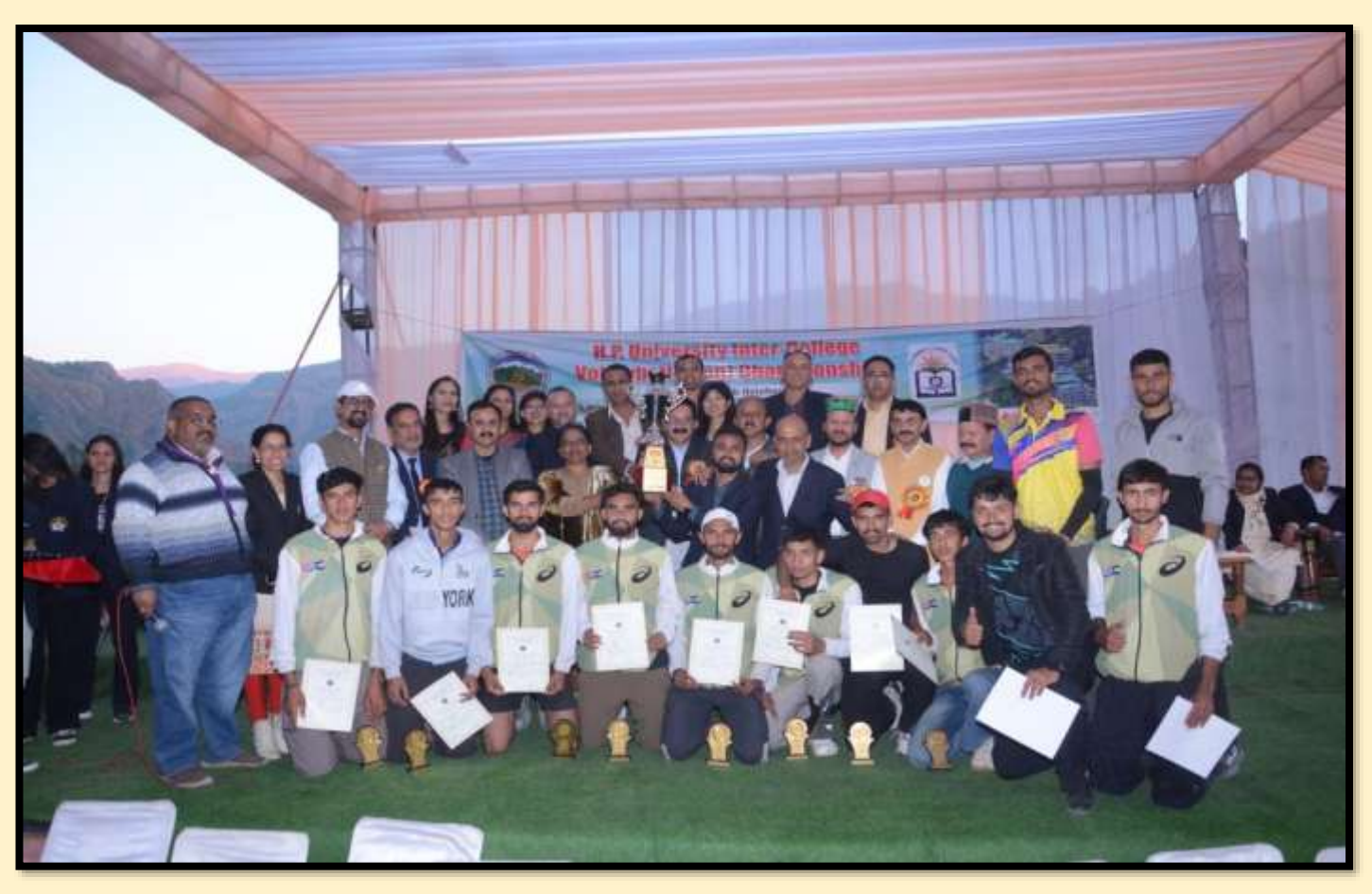
INTER - COLLEGE VOLLEYBALL CHAMPIONSHIP 2024-25