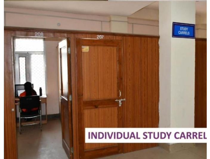
INDIVIDUAL STUDY CARREL